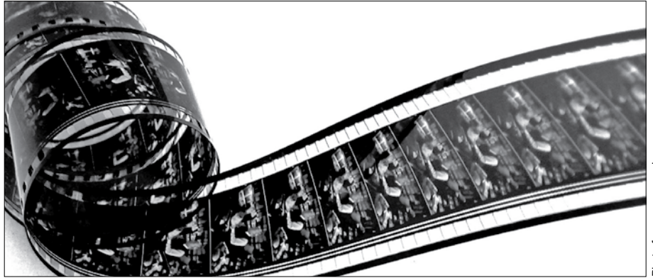
Figure 2. A collection of images in a film represents a behavioural pattern made up of individual frames or structured patterns .

The notion of 'intelligence' may require a design to be selected for a describable 'purpose or aim or function.'